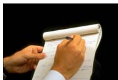
"The Trustees' Times"

This summer is about over, and there has been a real spirit-based outpouring of help for the church and it's people. We have much to do, but I am confident we will succeed in our goal to let the people know "we are rooted in Christ and continue to grow."